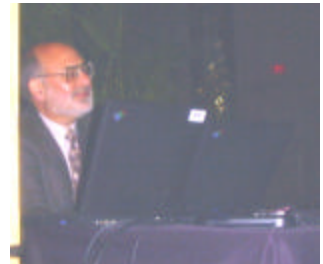
Remember the man behind the green curtain in Wizard of Oz? Will was it Wed. morning.

WOW: Easy. My WOW staff is the ace up my sleeve!