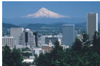
Portland, Oregon, USA

Please join us by contributing your ideas in any of the participation categories. We also accept corporate sponsorships and encourage students to apply as student volunteers. Please plan to come to the conference and bring your colleagues.