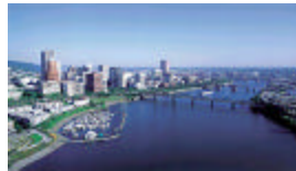
Portland, Oregon, USA

ICSE 2003 was overviewed in issue 3. Below are some key submission dates if you want to be on the ICSE 2002 technical program, followed by some more Oregon photos to entice you.