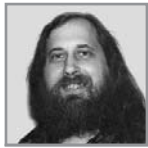
Richard Stallman - Against Software Patents Wednesday, 26 May 09:00 - 10:30hrs (Session a1) Room: Pentland Auditorium