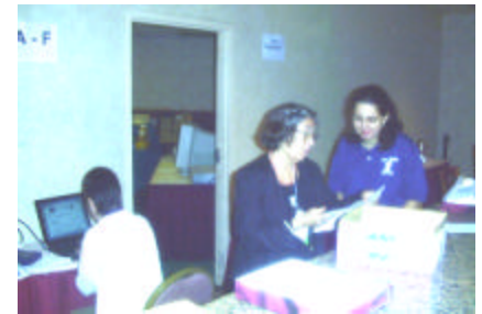
ICSE 2002 Registration Staff