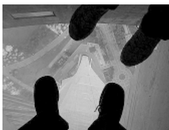
Looking down the CN Tower