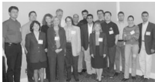
The Doctoral Symposium at a view

Be courageous! Be creative! Submit early, and submit often! Contest entries can be dropped off in the WOW contest drop-boxes at the registration, with the WOW reporters during the receptions, or come by the WOW pressroom in the Vice Regal Suite (3523, South Tower).